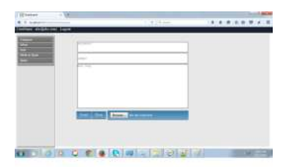
Fig-3: Composition Window

an order of image from multiple categories & register this sequence as identification along with its regular user id & password. When user tries to logging again he must have to select the same sequence from the shown category. This sequence is matched from database through pattern recognition. Image authentication techniques have recently gained great attention due to its importance for a large number of multimedia applications. Digital images are increasingly transmitted over non-secure channels such as the Internet