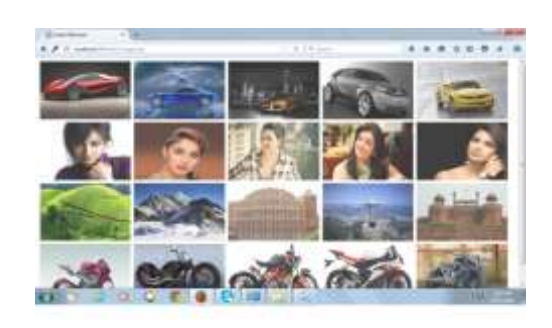
Fig-2: Image Authentication Window

First step is included in first level of security From which we can identifies that authorize user access the mail or not. System authenticate only access of authorize user. It is basic step of entering in to the system.