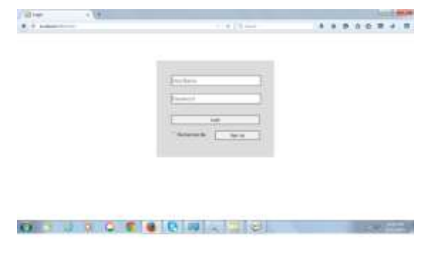
Fig-1: Login Window

comprehension of recreation and its determinations in subtle element.