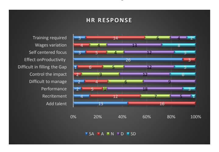
Fig.1 HR Managers Response about the effect of cultural diversity on HR

talent to organization. More than 70% respondents denied and stated that it doesn't affect the performance.